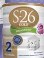
S26 Gold® Step 1 or 2 900g**