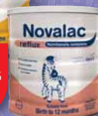
Novalac Anti Colic or Anti Reflux 800g**

*Always read the label. Use only as directed. #If symptoms persist consult your Health Care Professional. † Breastfeeding is best for babies. Pharmacies participating in this catalogue support and encourage breastfeeding of infants by their mothers. Please consult your healthcare professional for advice before using this product. †Stop smoking aid.